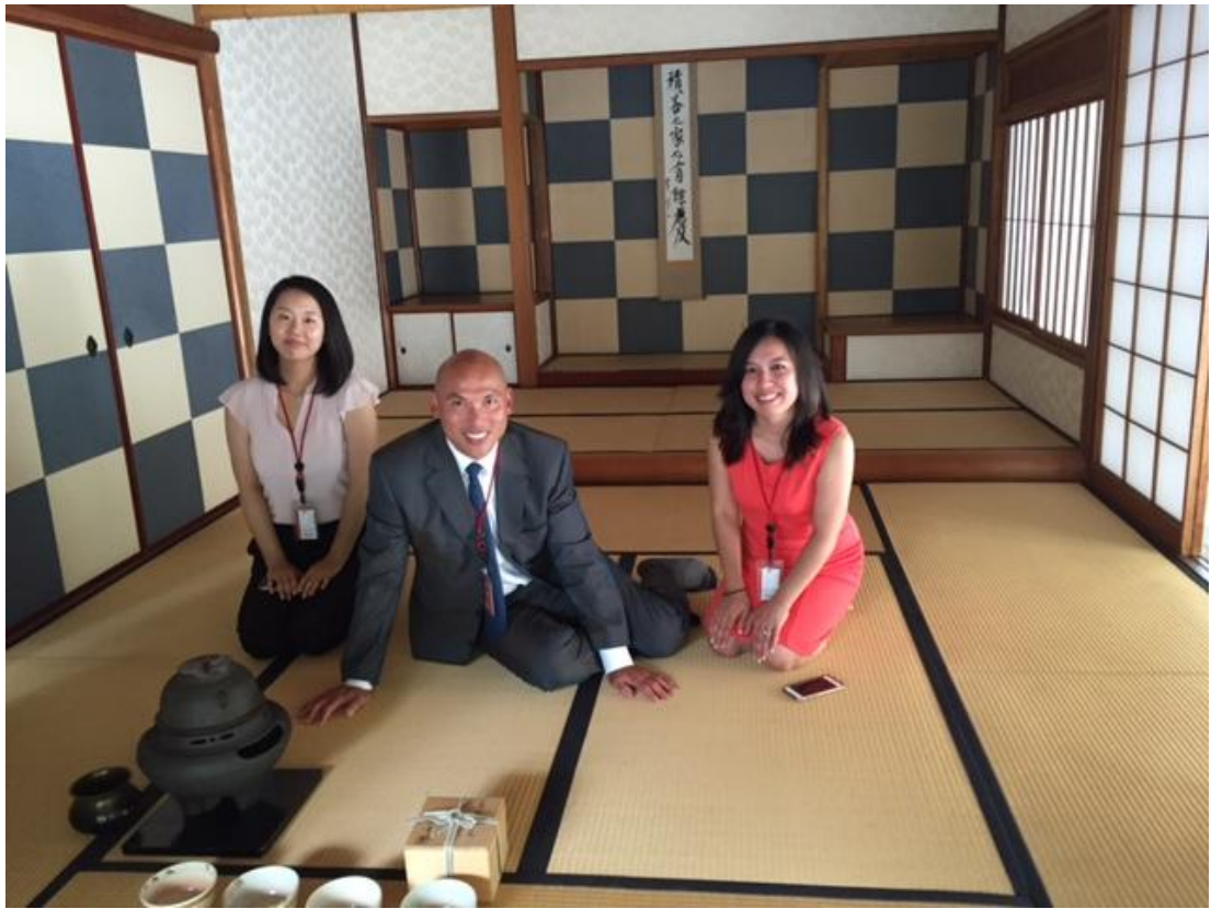
On July 21st, Commissioners & staff were treated to a tour of the Embassy of Japan's Ippakutei teahouse & the Old Residence building!