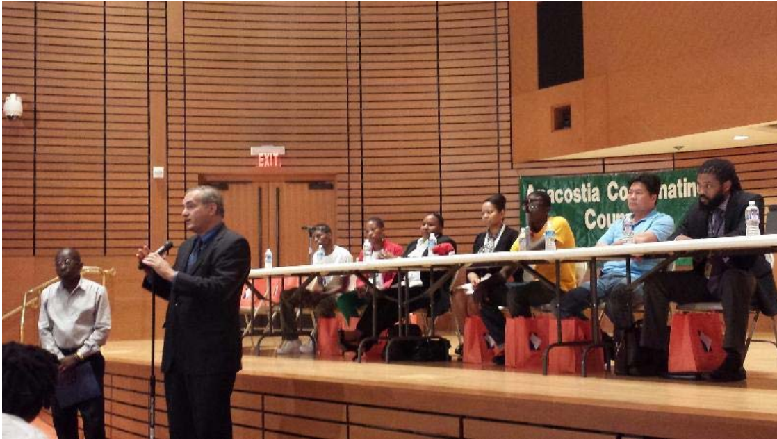
Panelists at the Ward 8 community forum.