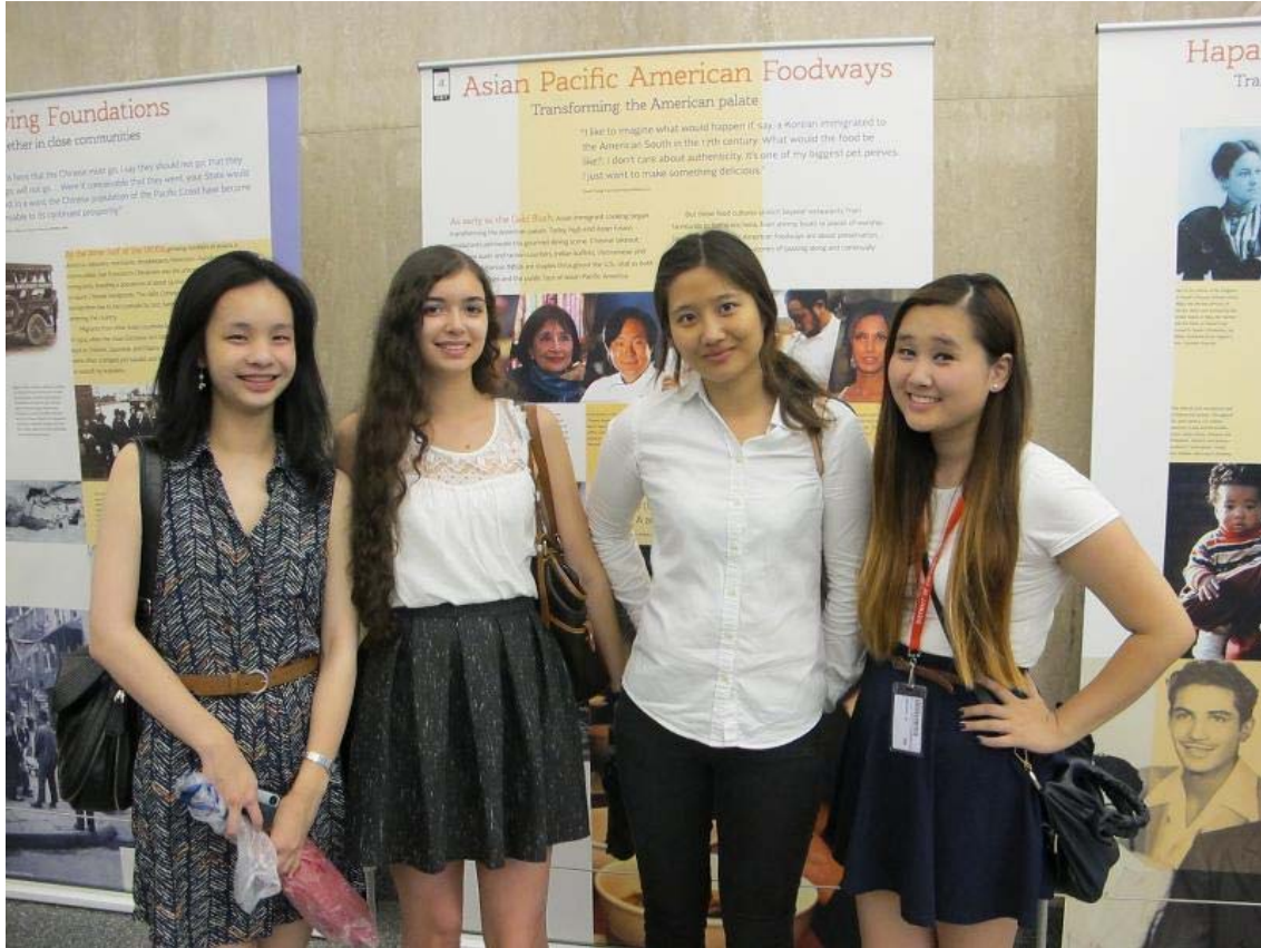
OAPIA interns in front of the Smithsonian exhibition.

OAPIA interns visited OCA - Asian Pacific American Advocates (OCA), a non-profit organization dedicated to advancing the social, political, and economic well-being of Asian Pacific Americans, on Tuesday, July 9, 2013. Afterward, the interns visited the I Want the Wide American Earth: An Asian Pacific American Story exhibition presented by the Smithsonian Asian Pacific American Center at the National Museum of American History.