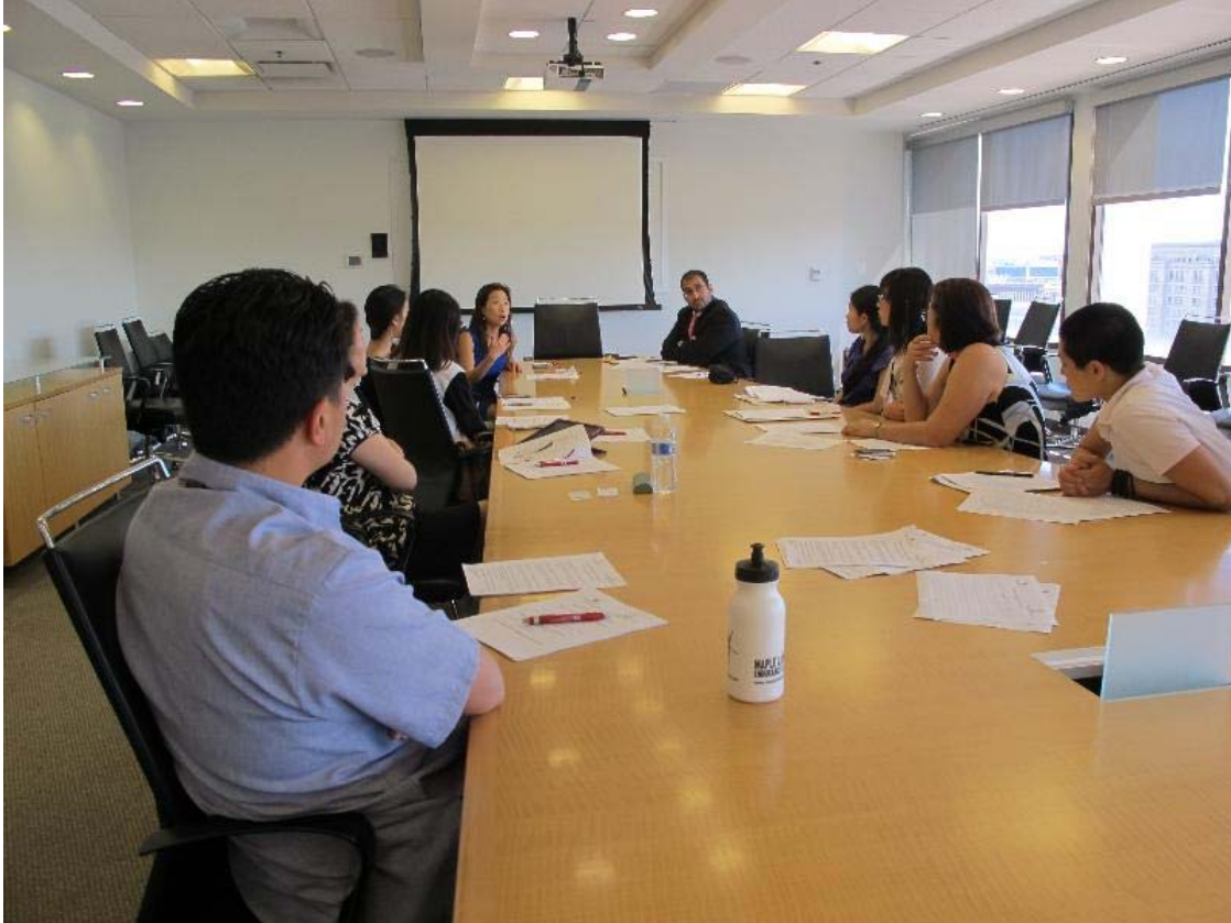
OAPIA meets with interested pre-bidders.