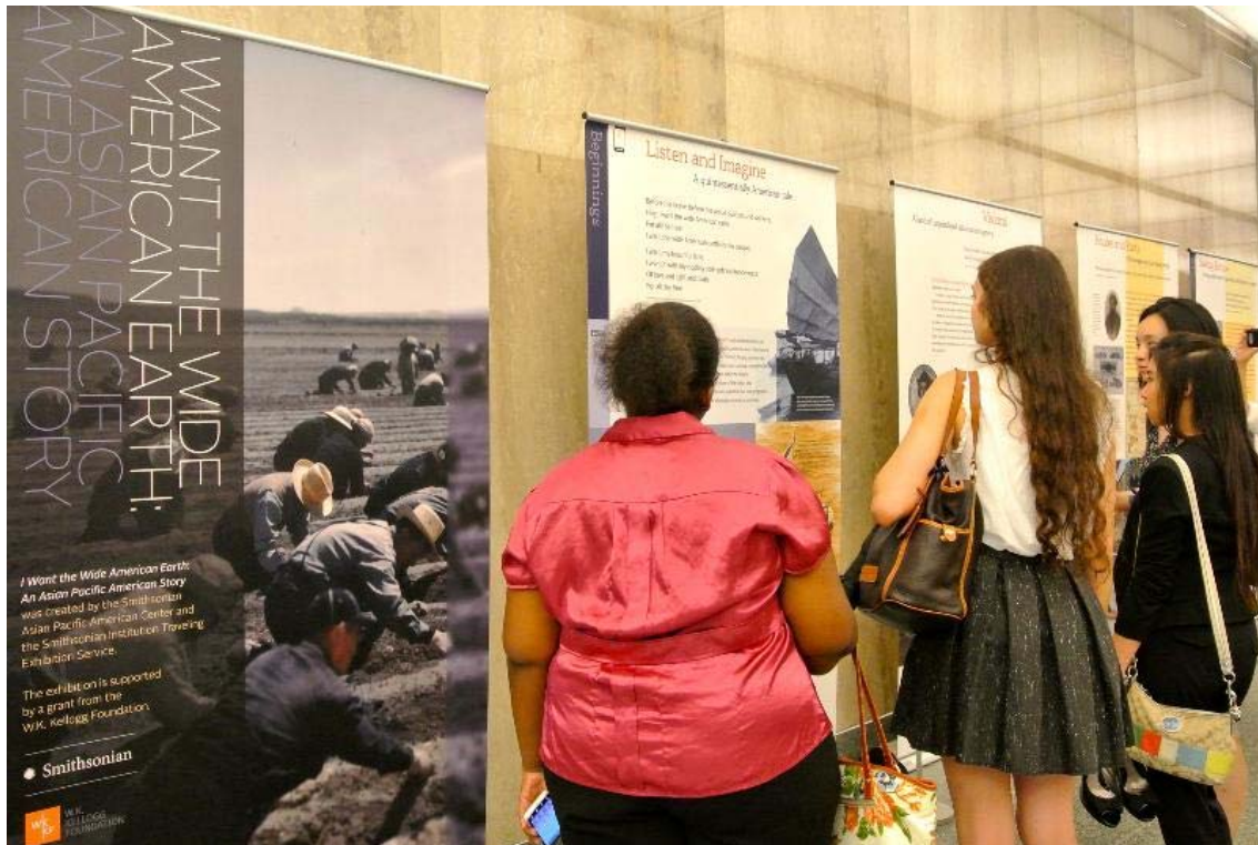
The Smithsonian exhibition, I Want the Wide American Earth: An Asian Pacific American Story, is seen by OAPIA interns.