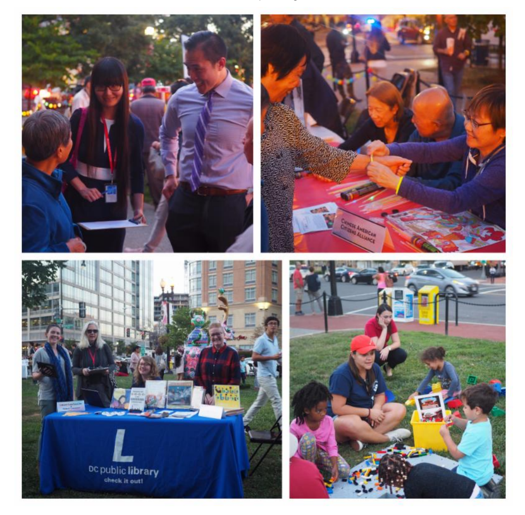
On September 29th, we wrapped up the 2017 Chinatown Park Series with the Mid-Autumn Festival celebration and movie screening of Mulan. Over 250 people joined us for the event. Check out more photos on <u>Flickr</u>.