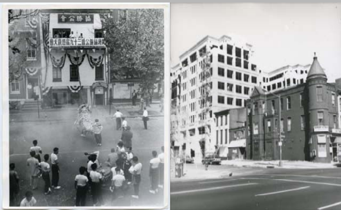
Streets of Old Chinatown

By 1884, the first site of Chinatown in the District existed along Pennsylvania Avenue with 100 residents. In 1898, it continued to expand to 3 rd Street, NW, and by 1903, there were many drugstores, barbershops, tailor shops, restaurants, laundry mats, and many other small businesses in the area. By 1970, 3000 Chinese individuals lived in and around Chinatown.