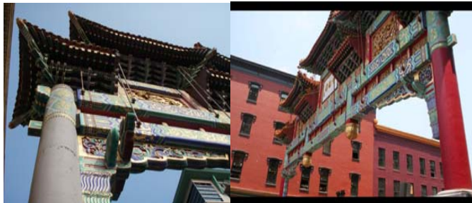
Left and right images: Before and after restoration.