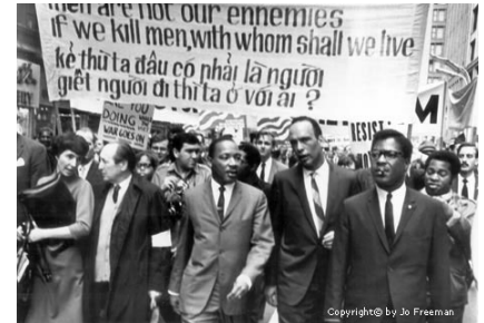
Chicago, 1968, march against the Vietnam War

A sign translated into Vietnamese demonstrating language access during the civil rights movement.